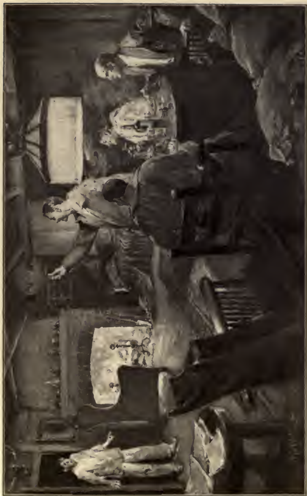
"Lo, the Conquering Hero."